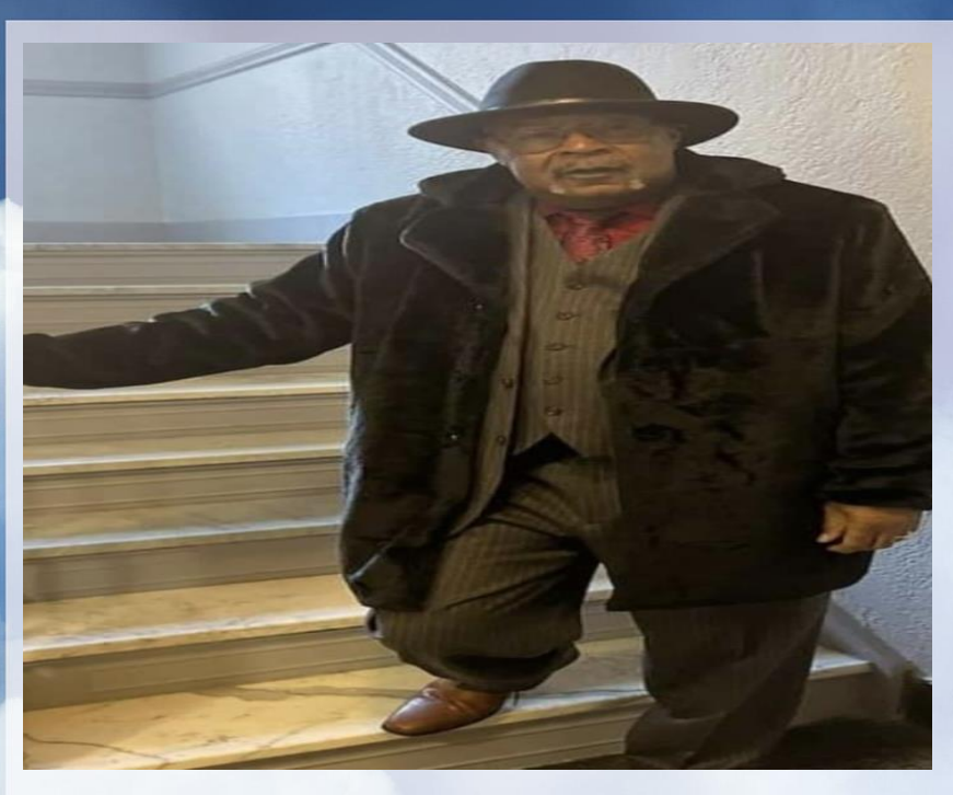
The Family of the late