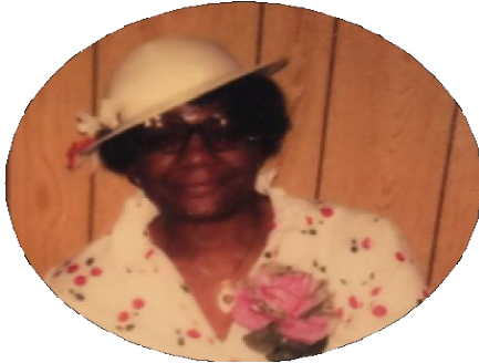
"I Made It Home"

I just wanted to let you know I made it home. Everything is so pretty here, So fresh and so new. I wish that you could close your eyes so you could see it too. Please try not to be sad for me. Try to understand. God is taking care of me...I'm in the shelter of His hands. Here there is no sadness, no sorrow and no pain. Here there is no crying and I'll never hurt again. Here it is so peaceful, When all the angels sing. I really have to go now... I have to try on my wings.